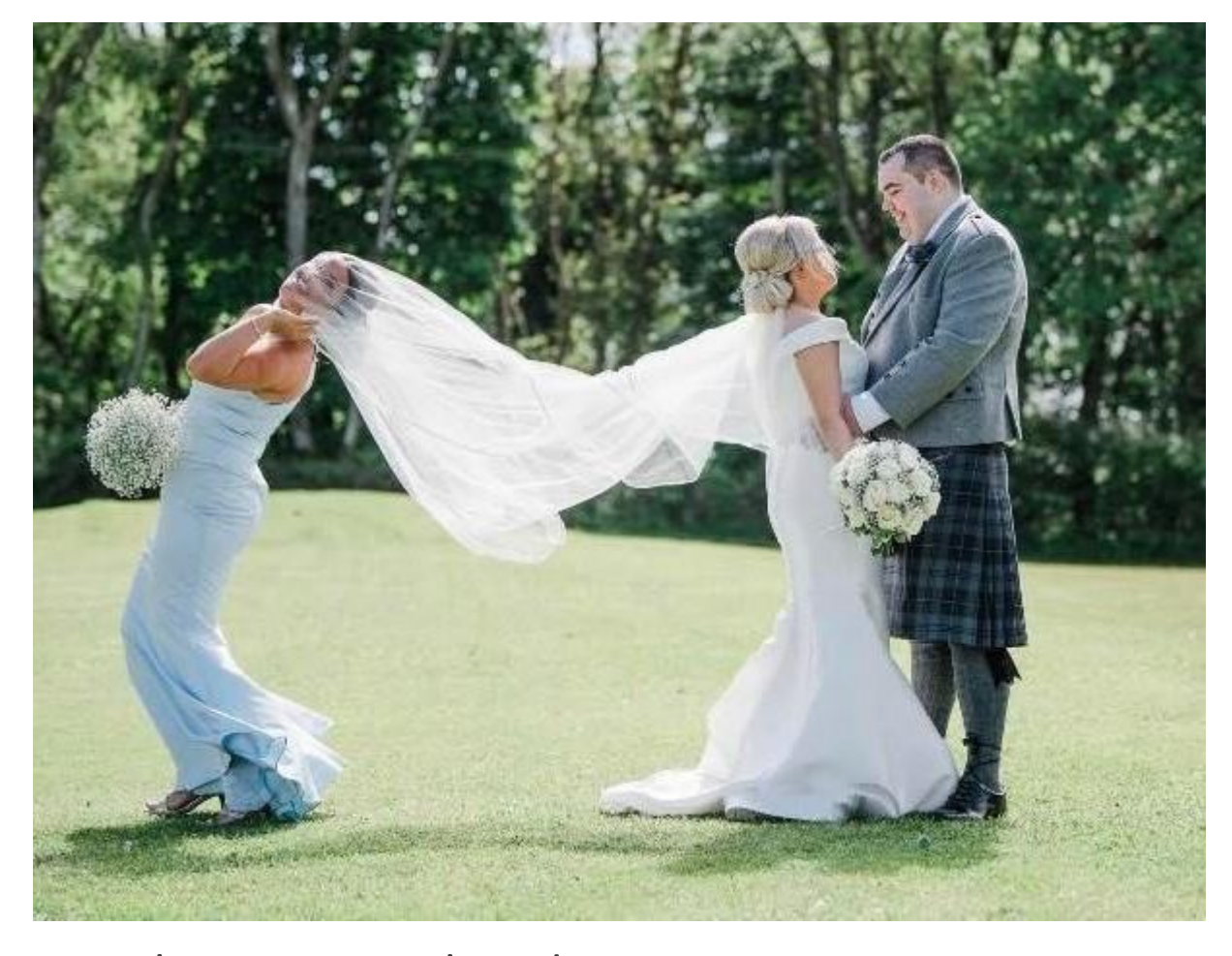
Sample Pricing 2025 based on 150 Evening Guests in Total £2,400

Dedicated Wedding Co-ordinator Executive Inhouse Wedding Designer - Jason Hall Design Choice of Prosecco, Orange Juice Drinks Reception for All Day Guests Evening Buffet - Finger Buffet (6 Sandwich fillings & 8 hot food items) or hot filled rolls